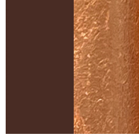
Coffee / Copper Leaf - CCL