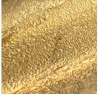
Gold Leaf - GLF