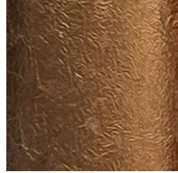
Bronze Leaf - BRL